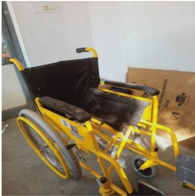
Fig:3 Wheel Chair