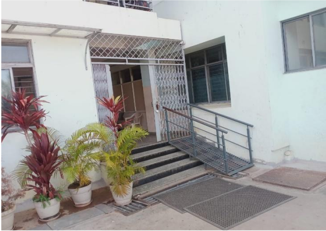
Fig: 1 Entrance Ramp